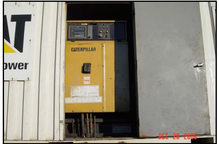
Figure 4 – Cat 3412C Gen Set had significant visible exhaust smoke which was eliminated. Fuel consumption at constant load was reduced from 11.2 gph to 8.6 gph (a very consistent 23.2% reduction).