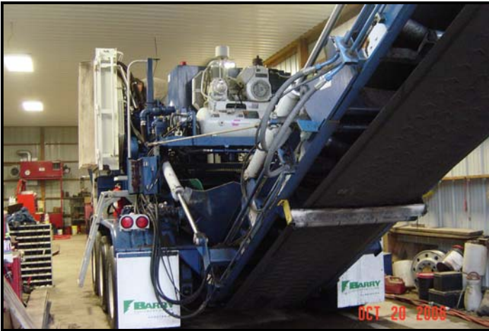
Figure 2 – Baseline fuel consumption estimated at 28.9 gph was reduced to 20-23.5 gph range (over 18% improvement) depending on density of material being processed which varied considerably.