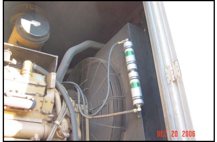
Figure 3 – FFHD-100 (dual in-line units) Millennium Series Fitch Fuel Catalyst installed on Caterpillar 3412C engine.